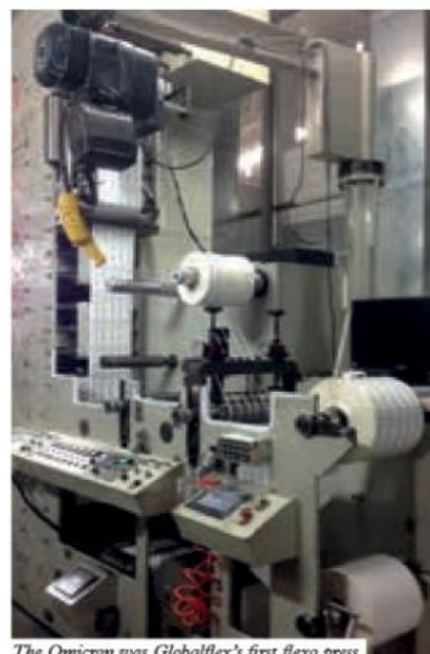
The Omicron was Globalflex's first flexo press

'We could see the trend of clients wanting to move from offset to flexo: flexo materials