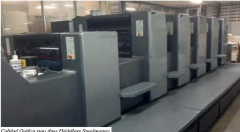
Calidad Gráfica runs three Heidelberg Speedmasters

are cheaper, and there can be more options for adding value through advanced finishing. But because the initial flexo press wasn't a success, we decided to create a new company, Globalflex, housed within the Calidad Gráfica factory, and invest in an Omicron press, slitter rewinder and sleeve equipment.'